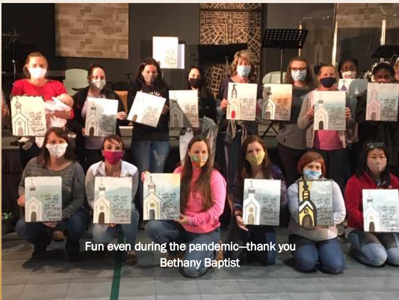
Fun even during the pandemic—thank you Bethany Baptist