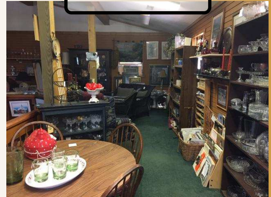
Solus Christus Thrift Store

Please pray each woman finds life in Jesus. “Thou wilt make known to me the path of life. In Thy presence is fulness of joy. In Thy right hand there are pleasures forever.” Ps 16:11